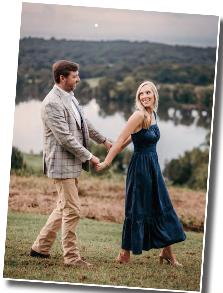
Story by Rachel Totten / Photos courtesy of Windy Hill Farm and Preserve