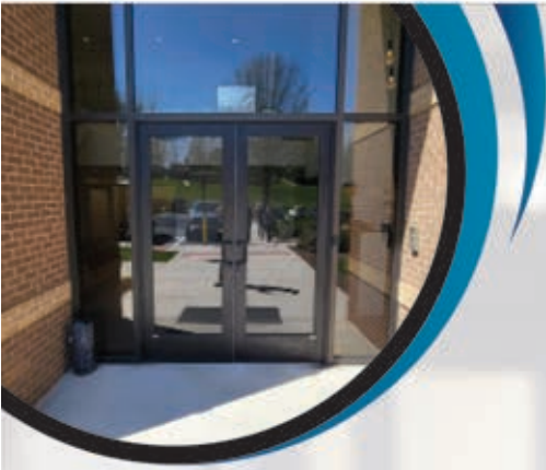
Storefront Doors, Windows, & Entrance Systems