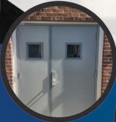
Hollow Metal Doors & Wood Doors