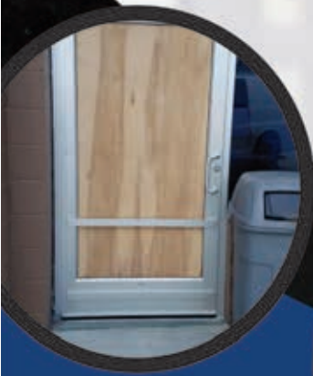
Board Ups & Glass Replacement

Our team is highly experienced with each Service Technician having an average of 25 years' industry experience . We are a woman-owned local small business serving the East Tennessee area since February 2019.