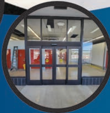
Automatic & ADA Entrances